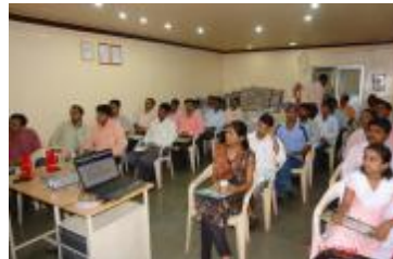
One Day Programme on 'cGMP, Quality, Productivity, Positive Attitude as a organization culture for corporate growth.' at Wanbury Limited, Patalganga, Raigad Date : 7th Sept. 2010