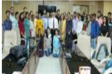
Scope and Potential After Pharmacy at DPSRU Date: 11-09-2018