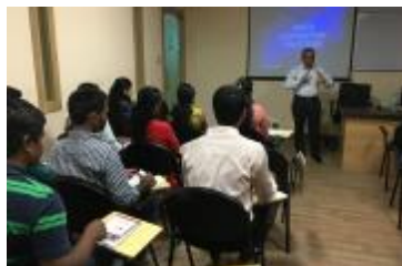
cGMP Training Programme at Ventr Biologicals Date: 5-7-2017