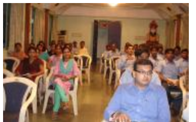
"cGMP, Quality Productivity and Positive Attitude as a organization culture for corporate growth" at Leben Laboratories Pvt. Ltd., Akola, Date: 18/09/2010