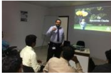
cGMP training for Wockhardt Date: 16-1-2018