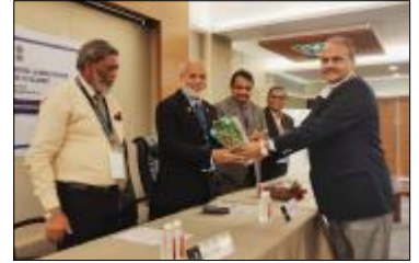
cGMP, Quality, Impurity Profile Training conducted for FDCA Gujarat Officers, Date: 2-3-2019