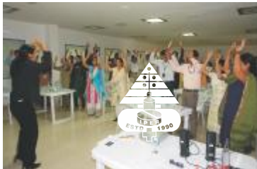
Programme on 'Positive Attitude, Hard work, Skill, Knowledge Right Prescription for Success' at Centaur Pharmaceuticals Pvt. Ltd. Pune Date: 30th July 1,2,3 August, 2009