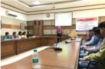
cGMP and Attitude Programme for Cipla Ltd. at BUEST Date: 27-10-2018