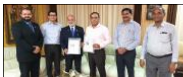
Sandip Institute of Pharmaceutical Sciences, Sandip Univesity, Nashik Collaborated with I.P.E.R. for Conducting Pharma Management Programmes for Skill Development of Students.