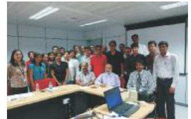
'US-FDA: Key Features of cGMP' Training for Siemens Information Systems Ltd., Mumbai Date: 7 & 8 May, 2009