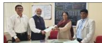
Sinhgad College of Pharmacy, Vadgaon Collaborated with I.P.E.R. for Conducting Pharma Management Programmes for Skill Development of Students.