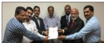
Wockhardt Collaborated with I.P.E.R. for Pharma Management Programmes and Training for all its manufacturing plants in India.