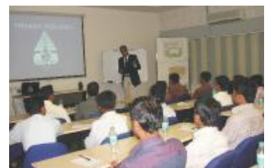
cGMP, Validation and Positive Attitude at Fresenius Kabi India Pvt. Ltd., Date: 5 & 6 /01/2012