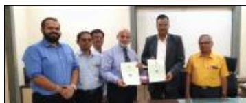
R. C. Patel Institute of Pharmaceutical Education and Research, Shirpur Collaborated with I.P.E.R. for Conducting Pharma Management Programmes for Skill Development of Students.