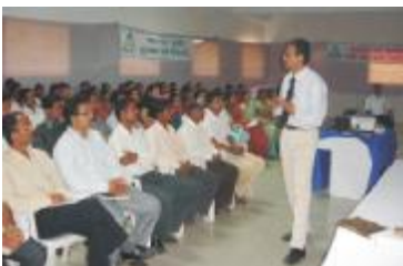
Programme on 'Principle of Safety and Health Environment in Pharmaceuticals' at Okasa Pharma Pvt. Ltd., Satara, Date: 6th March, 2011