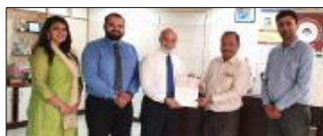
PES Modern College of Pharmacy (Ladies), Moshi Collaborated with I.P.E.R. for Conducting Pharma Management Programmes for Skill Development of Students.