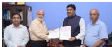
AKS University, Satna, M.P. Collaborated with I.P.E.R. for Pharma Management Programmes and Training for Students.