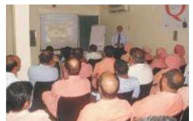
"cGMP, Quality, Positive Attitude and Safety Right prescription for Success" at GlaxoSmithKline Pharmaceuticals Limited Date: 31st May, 2012