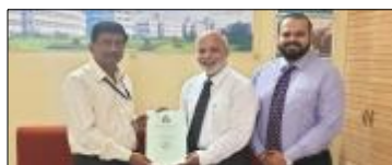
Sinhgad Institute of Pharmacy, Narhe Collaborated with I.P.E.R. for Conducting Pharma Management Programmes for Skill Development of Students.