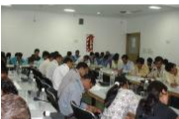
"cGMP, Quality Productivity and Positive Attitude as a organization culture for corporate growth" at Akums Drugs and Pharmaceuticals Ltd., Date: 24th February 2010