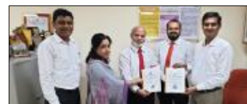
Smt. Kashibai Navale College of Pharmacy, Pune Collaborated with I.P.E.R. for Conducting Pharma Management Programmes for Skill Development of Students.