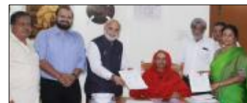
S. J. M. College of Pharmacy, Chitradurga, Karnataka Collaborated with I.P.E.R. for Pharma Management Programmes and Training for Students.