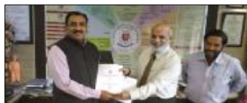
Modern College of Pharmacy, Nigadi Collaborated with I.P.E.R. for Conducting Pharma Management Programmes for Skill Development of Students.