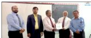
I.P.E.R. signed an M.O.U. with Priyadarshani College of Pharmacy, and Prakruti College of Pharmacy, Koratagere, Karnataka, for conducting Pharma Management programmes and One Day Certificate Programmes for Skill Development of Pharmacy students.